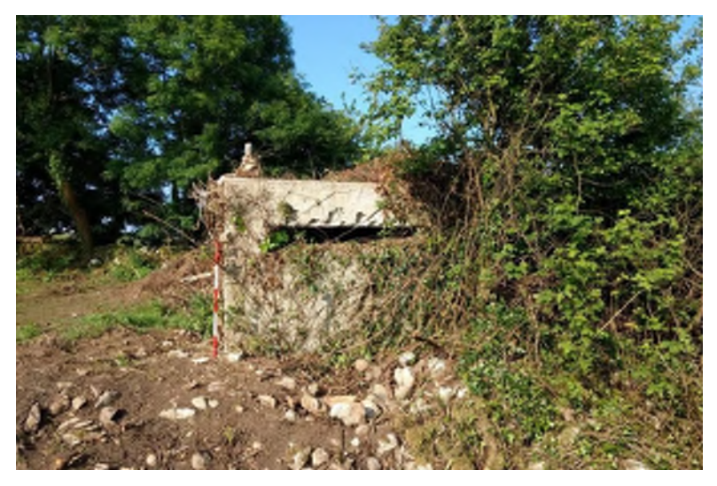
Plate 14.26 North elevation of pillbox Ch. 103, facing south