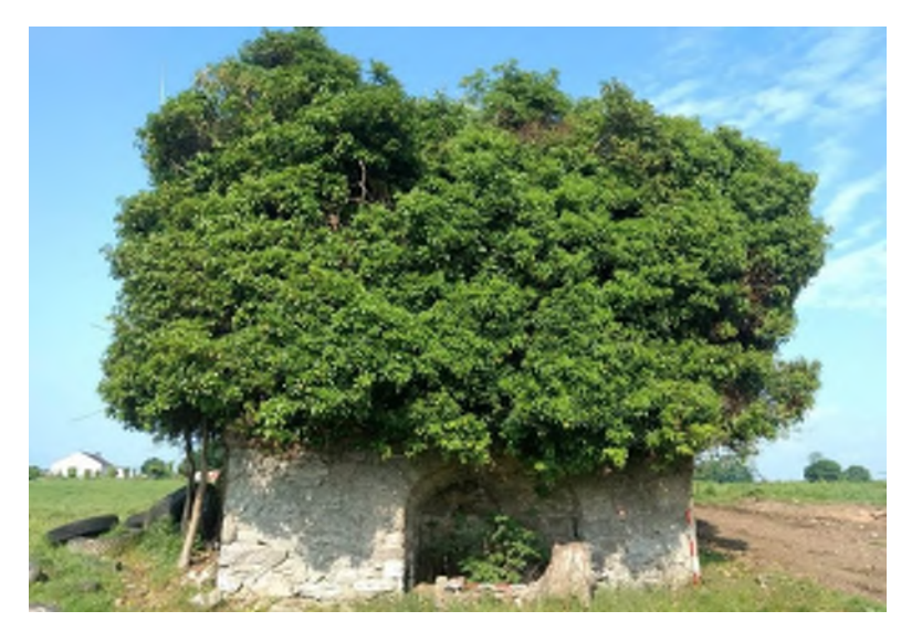
Plate 14.64 Disused limekiln Ch. 31, facing west