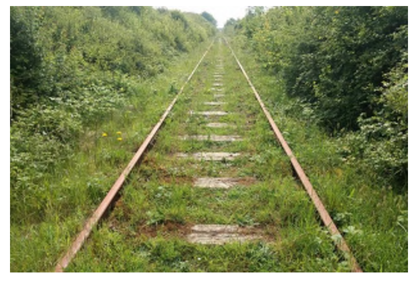
Plate 14.51 Railway Ch. 18, facing southeast