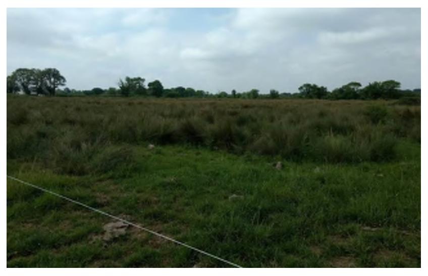
Plate 14.95 View towards LI 56, possible enclosure, facing southwest