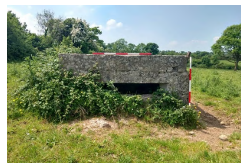
Plate 14.38 Eastern elevation of BH 27, facing west