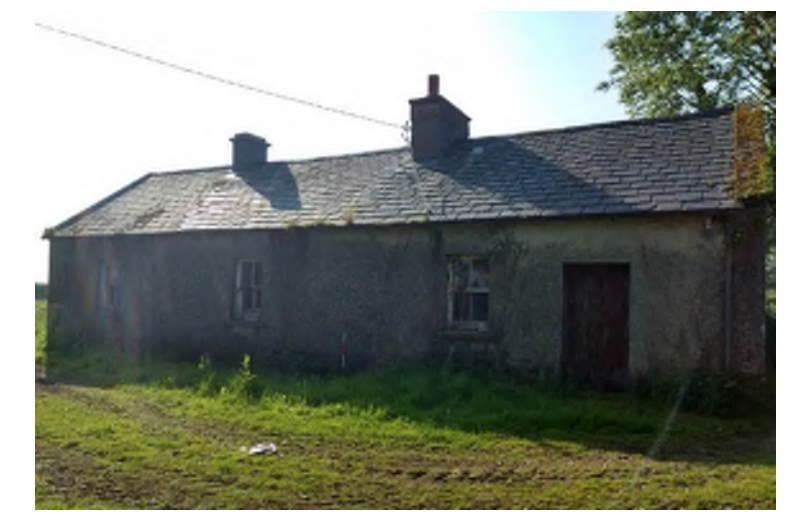
Plate 14.22 Ch. 9, farmhouse southside of Scheme boundary, facing south