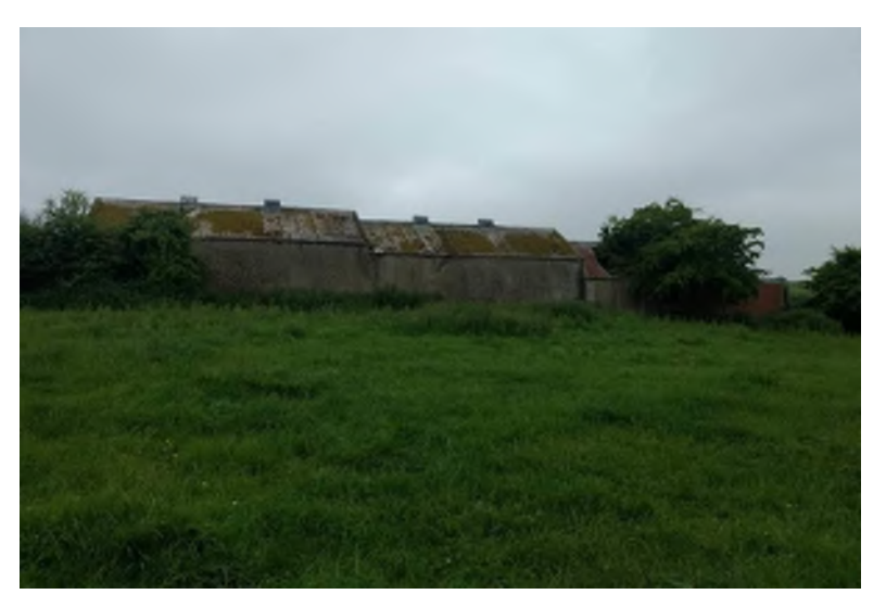
Plate 14.109 Vernacular farm structure, Ch. 100, facing south