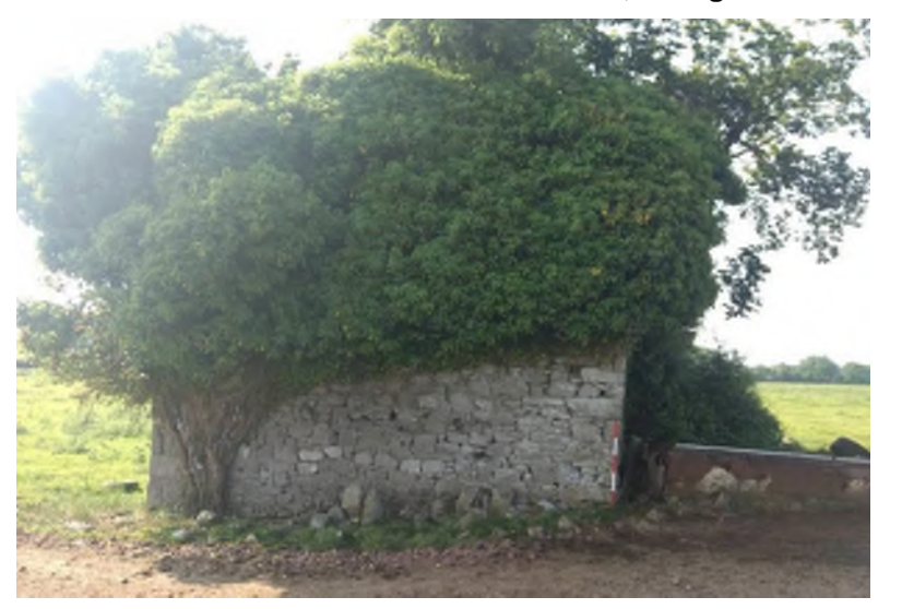
Plate 14.66 Disused limekiln Ch. 31, facing south