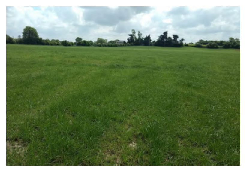
Plate 14.11 View towards LI 9, low profile ringfort, facing southeast