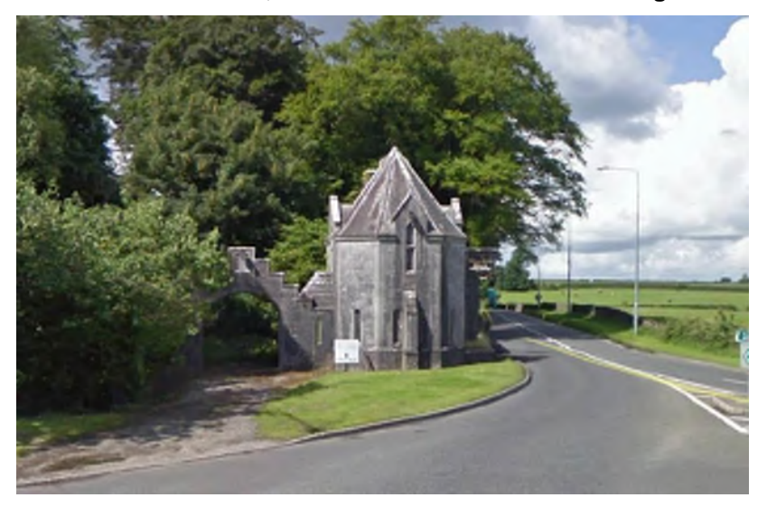
Plate 14.118 BH 22, Lantern Lodge facing west