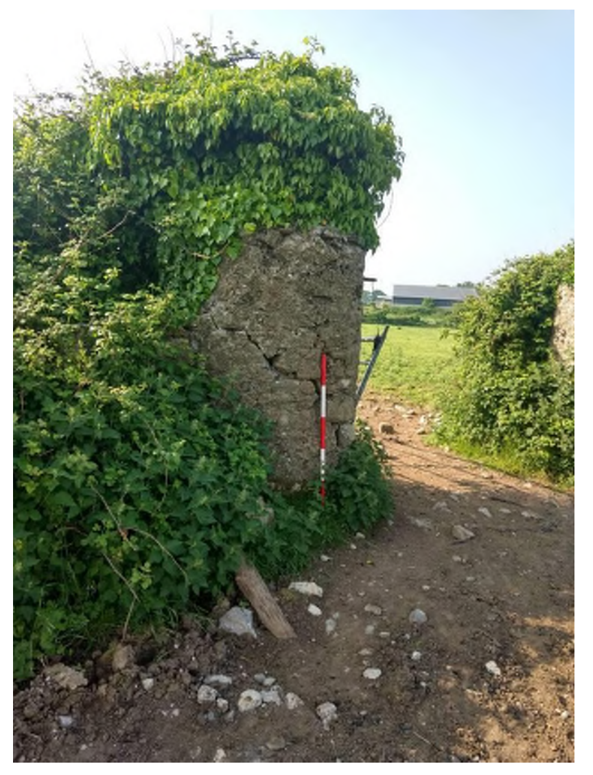
Plate 14.62 Large gate posts Ch.105, facing southwest