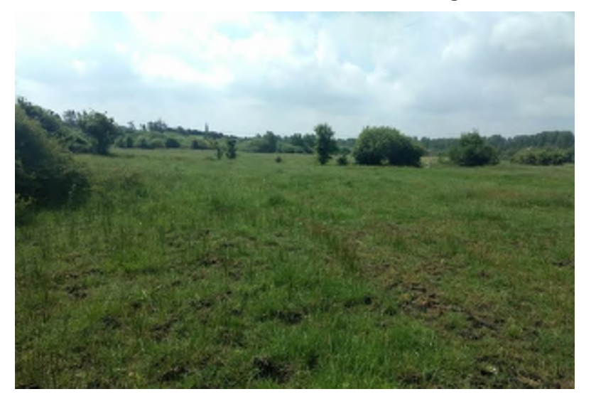
Plate 14.70 AAP 19, facing south