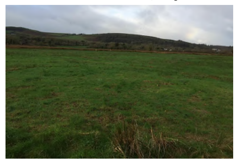
Plate 14.3 LI 84 possible ringfort, facing southwest