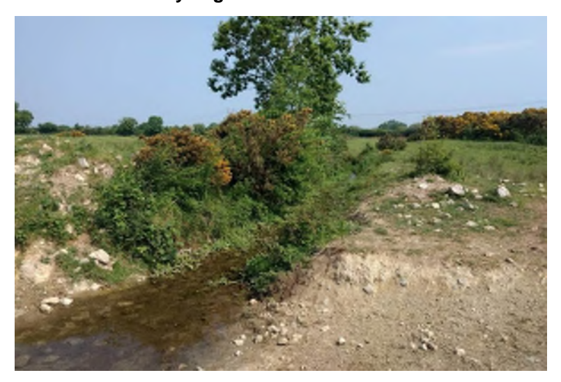
Plate 14.50 TB 11, facing north-northeast