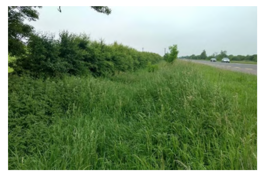
Plate 14.121 View along edge of existing N21 verge, facing west