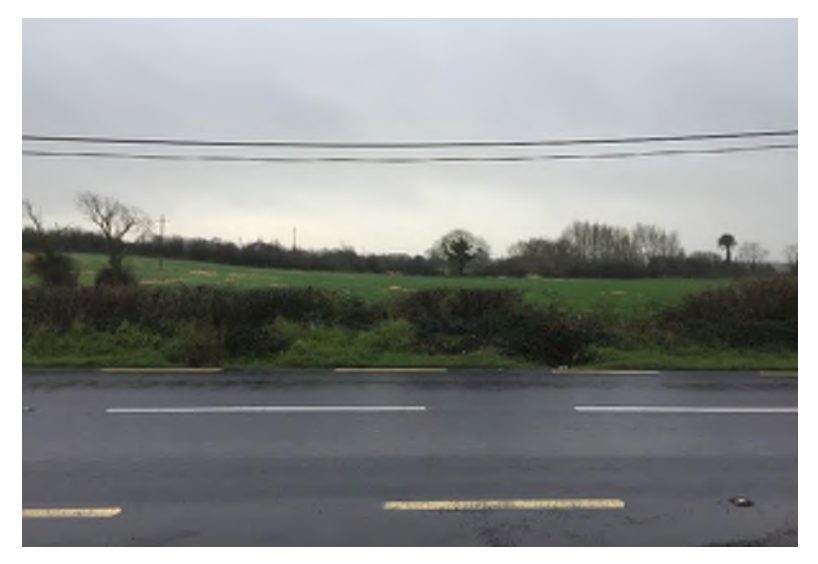
Plate 14.15 View from BH 17 Robertstown Church, facing north