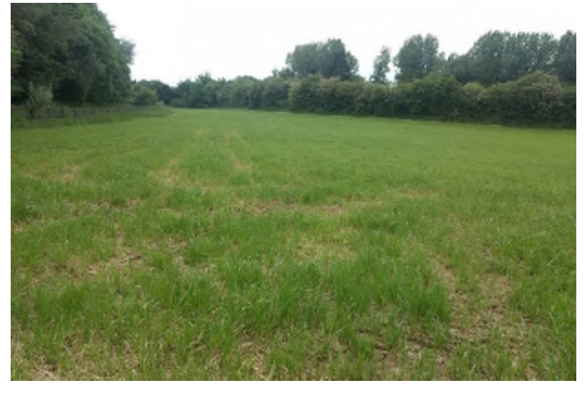
Field at Ch. 28+150, facing west-southwest

Plate 14.71 Field at Ch. 0+400, Rathkeale, facing southwest