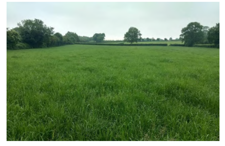
Plate 14.119 View towards AH 62, enclosure, facing east