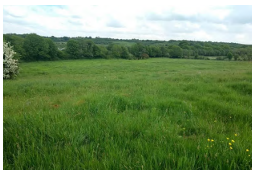
Plate 14.17 View towards TB 5, facing east-southeast