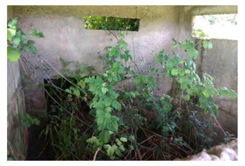
Plate 14.35 Internal view of BH 27, facing south