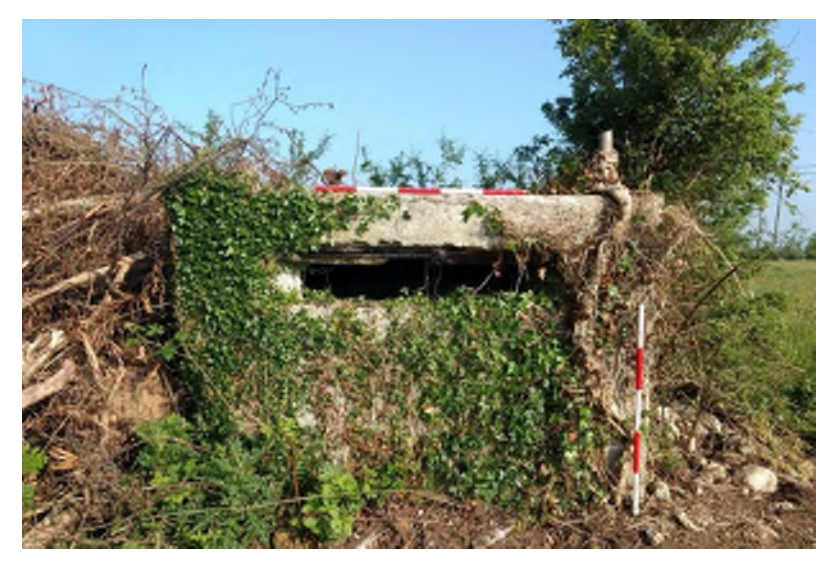
Plate 14.27 East elevation of pillbox Ch. 103, facing west