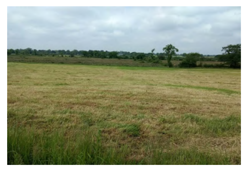
Plate 14.96 View from possible moated site LI 57 facing west