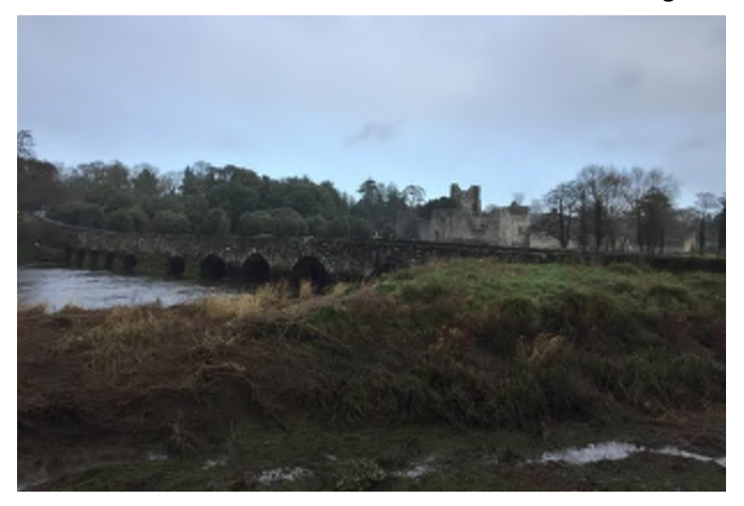
Plate 14.115 BH 41, Desmond Castle facing northeast