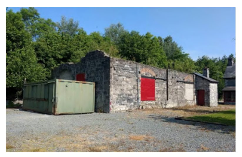
Plate 14.74 Goods shed BH 1 to the west of Irish Palatine Heritage Centre, facing north