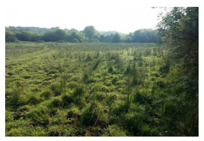
Plate 14.60 AAP 15, facing northwest