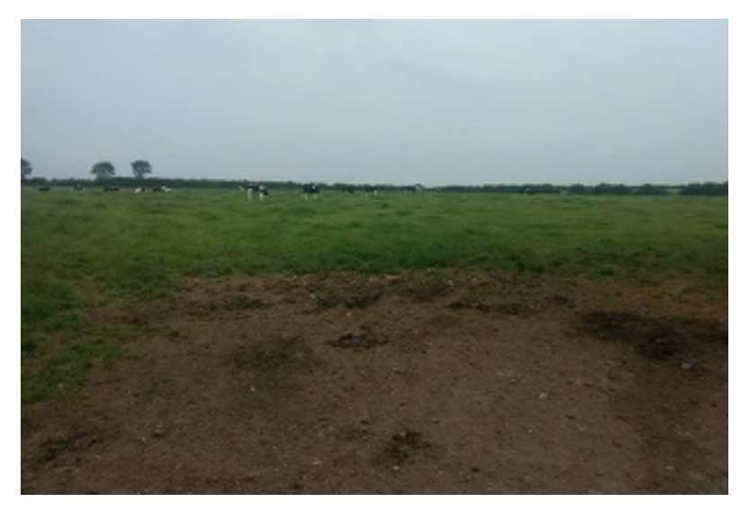
Plate 14.80 Field at Ch. 53+300, facing northwest