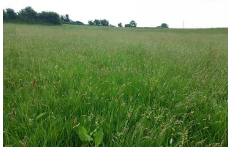
Plate 14. 87 Field at Ch. 57+025, facing south