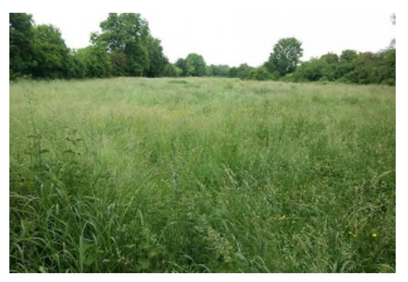
Plate 14.88 Field at Ch. 56+625 facing north