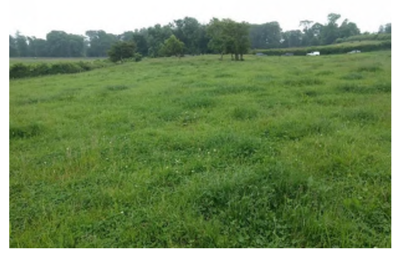
Plate 14.111 View of AH 42, enclosure, facing south