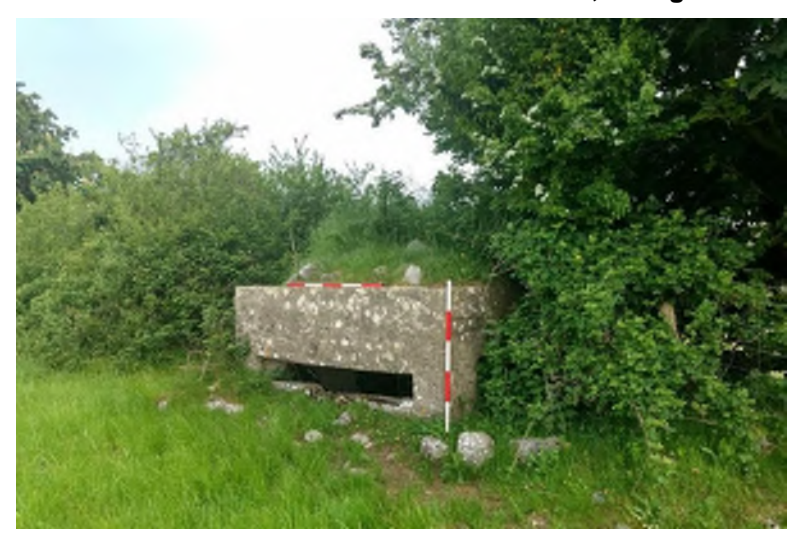
Plate 14.45 Southwest elevation of pillbox Ch. 104, view from southeast