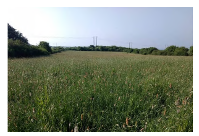
Plate 14.21 Field 3 at Ch. 5+200 facing south