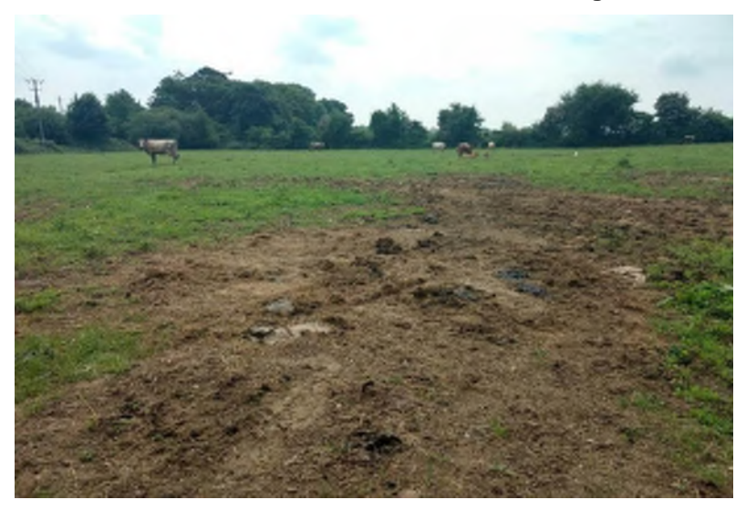
Plate 14.67 Field at Ch. 26+700, facing south