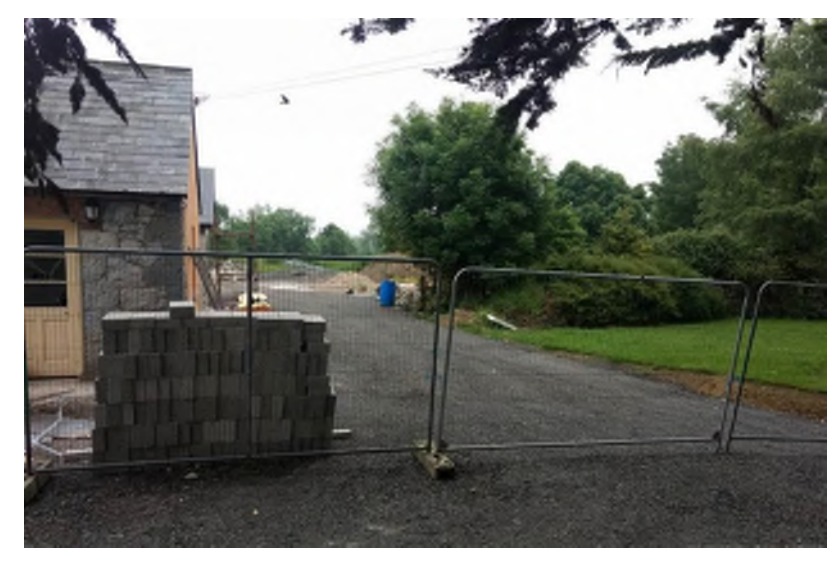
Plate 14.105 Renovation of vernacular structure at Ch. 61+650, facing north