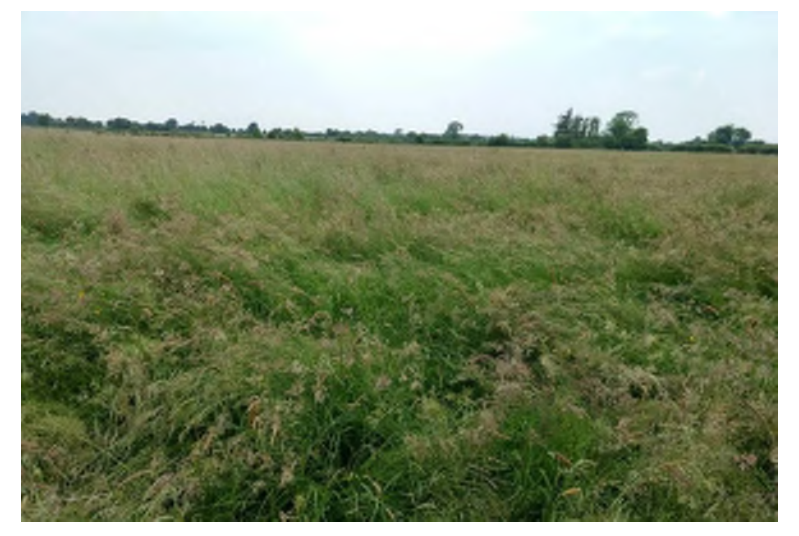
Plate 14.83 View towards LI 75, curvilinear bank, facing northnortheast