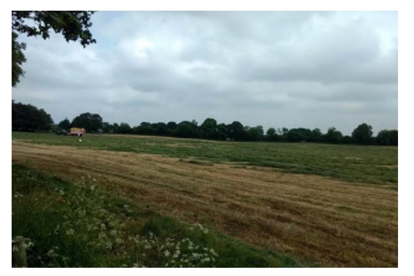
Plate 14.94 View towards LI 63, mound, facing north