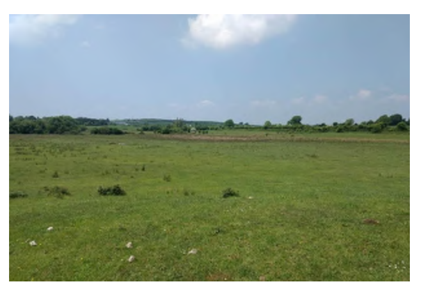
Plate 14.40 View from BH 25, facing west