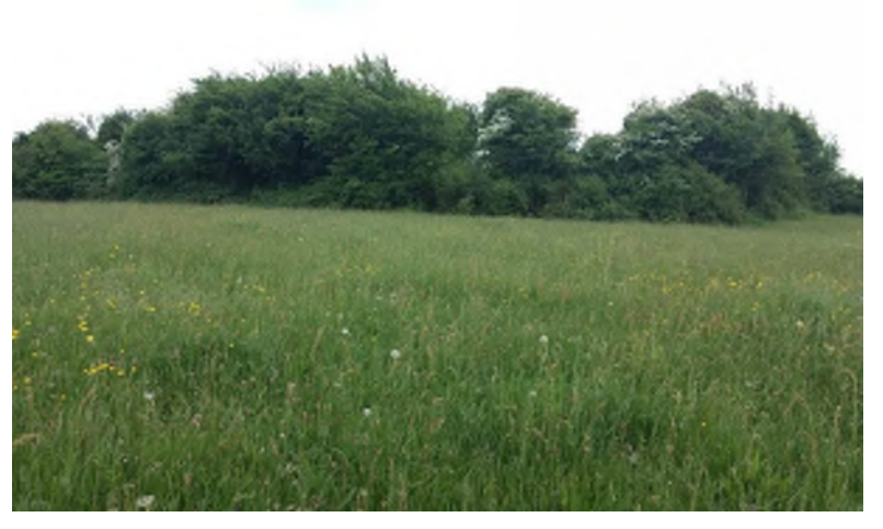
Plate 14.18 View towards ringfort AH 7, facing south