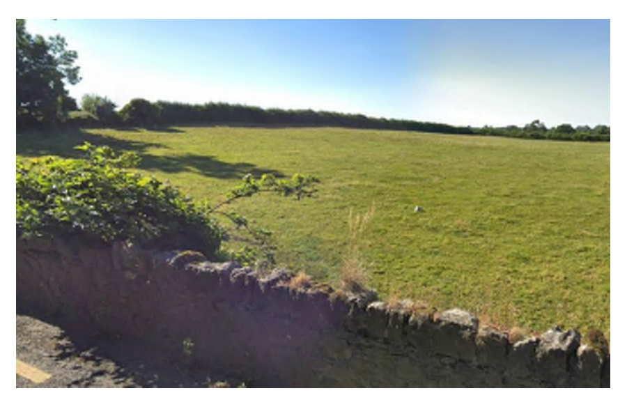
Plate 14.117Wall opposite Adare Manor demesne wall, facing north