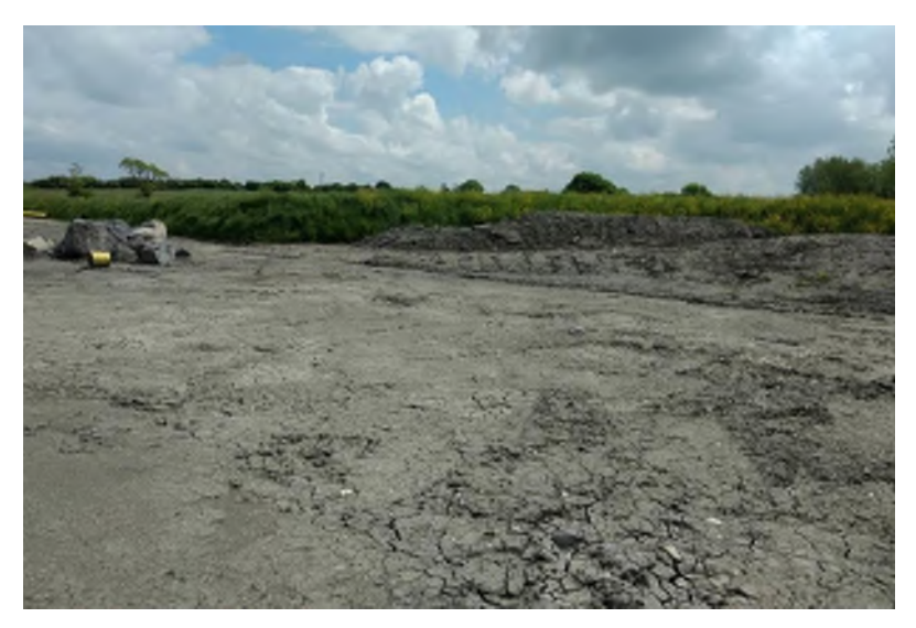
Plate 14.12 Disturbed ground south of N69, facing southeast