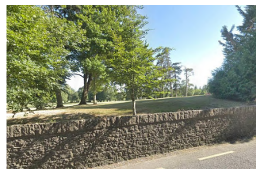
Plate 14.116 BH 36, Adare Manor demesne wall facing south