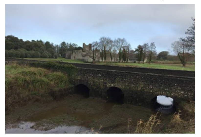
Plate 14.114 BH 41, Desmond Castle facing northeast