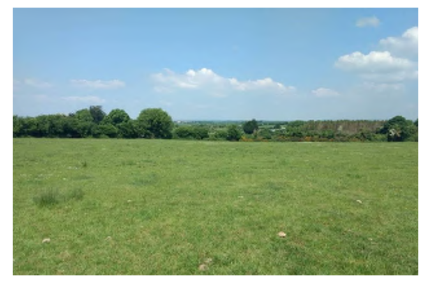
Plate 14.30 View from BH 26, facing north