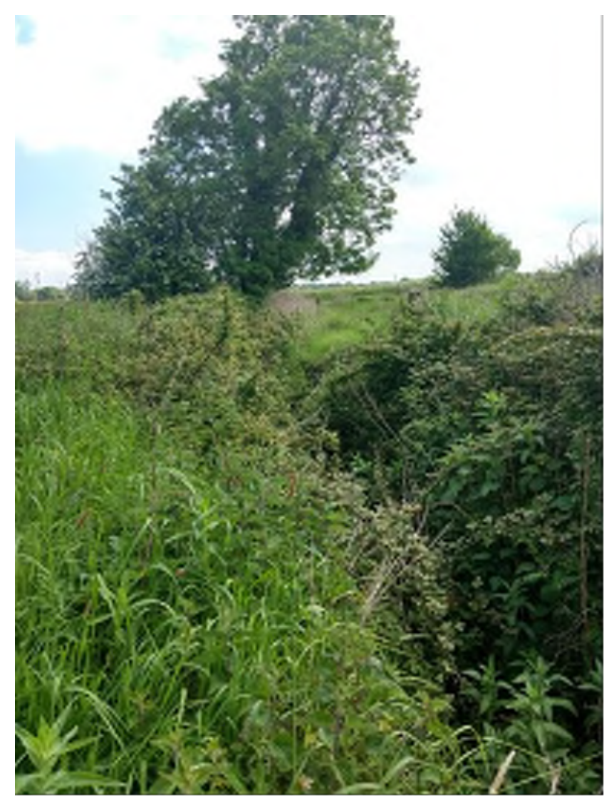
Plate 14.5 TB 1, facing east