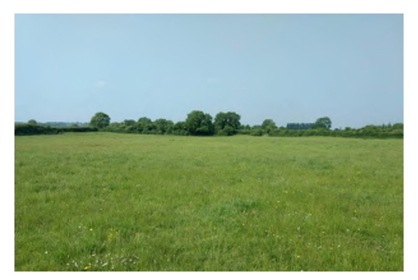
Plate 14.49 View towards LI 14, possible ringfort, facing west