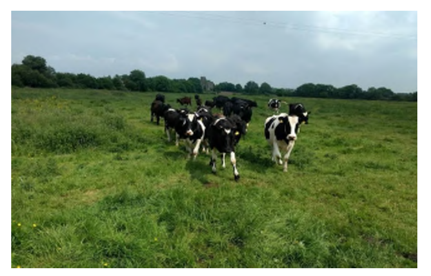
Plate 14.85 View towards A