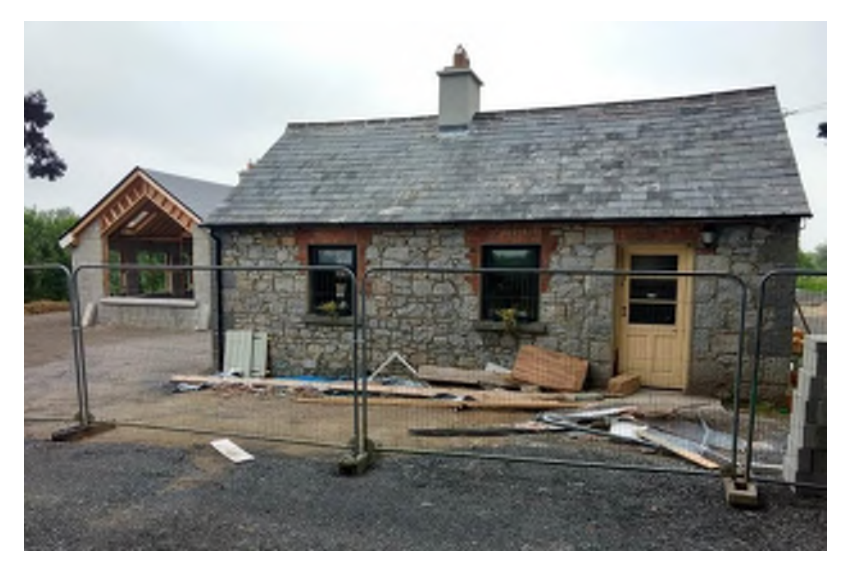
Plate 14.104 Renovation of vernacular structure at Ch. 61+650, facing north