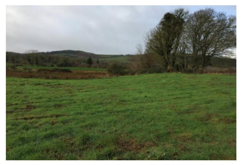
Plate 14.2 LI 4 oval raised area, facing southwest