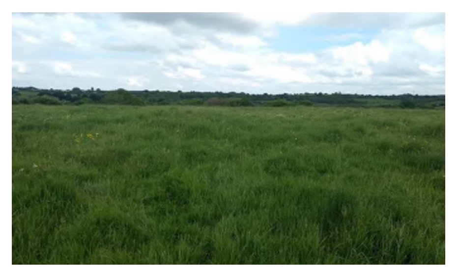
Plate 14.19 Ch. 8, relict field system. Facing east