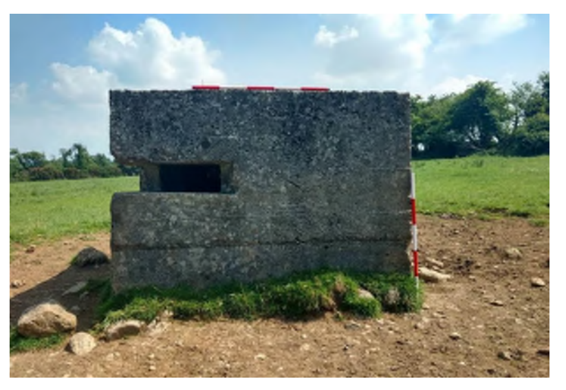
Plate 14.32 Southern elevation of BH 26, facing north