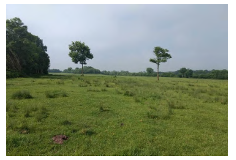
Plate 14.47 View towards LI 40, small enclosure, facing south