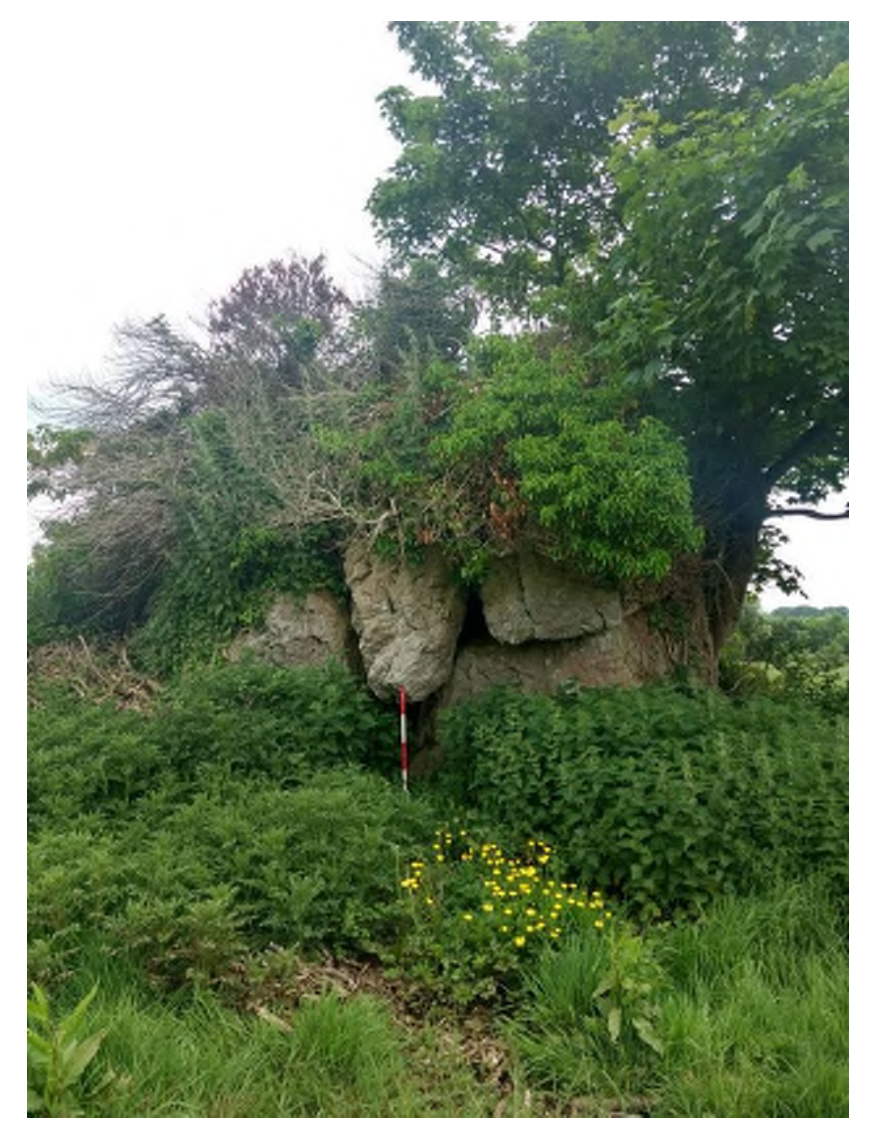
Plate 14.78 Stone outcrop in field at Ch. 51+450, facing southeast