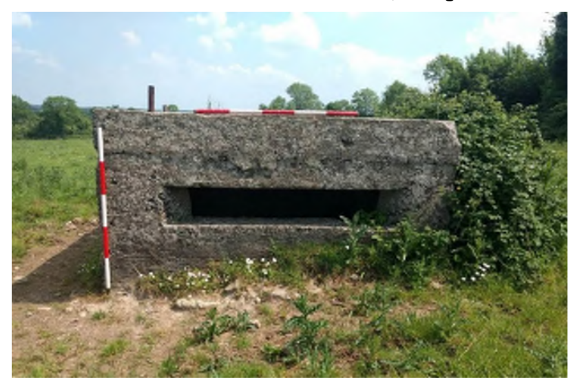
Plate 14.37 Western elevation of BH 27, facing east