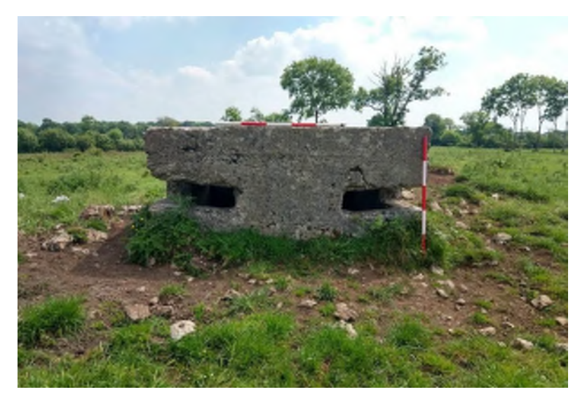
Plate 14.43 Western elevation of BH 25, facing east