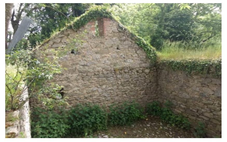
Plate 14.58 Eastern gable of vernacular farm structure Ch. 85, facing southwest

Vernacular farm structure Ch. 85, facing south