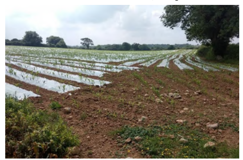
Plate 14.91 Field at Ch. 58+400 facing south