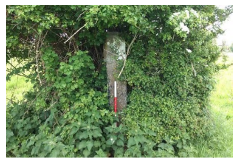
Plate 14.10 Possible starching/gate post, Ch. 102, facing east