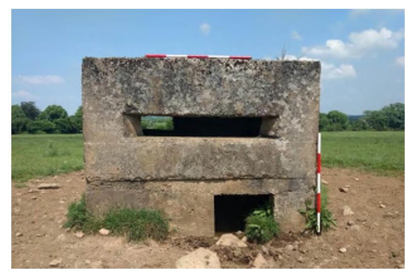
Plate 14.31 Southern elevation of BH 26, facing north