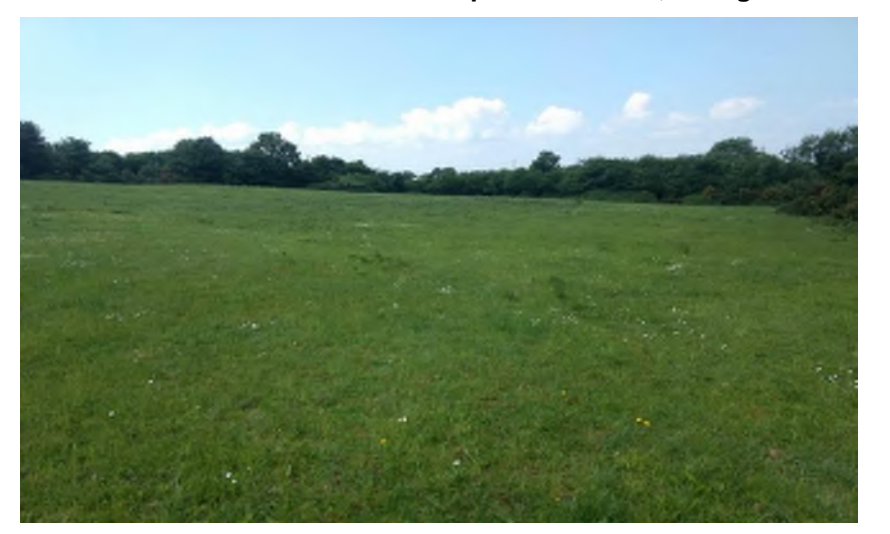
Plate 14.29 View towards LI 34, possible enclosure/farmstead, facing north-northwest