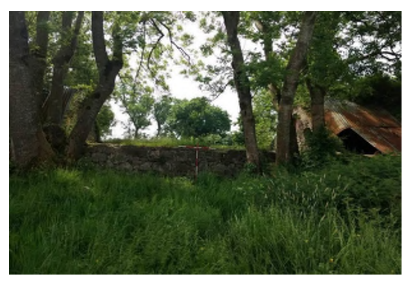
Plate 14.55 Vernacular farm structure Ch. 85, facing south