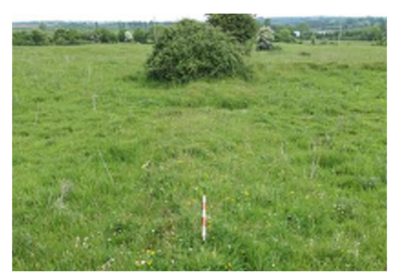
Plate 14.7 Relict field boundaries Ch. 4, facing south