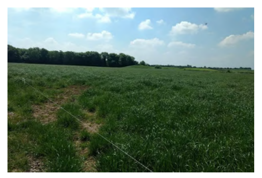
Plate 14.59 Field at Ch. 24+300 with LI53 (mound), facing southsoutheast