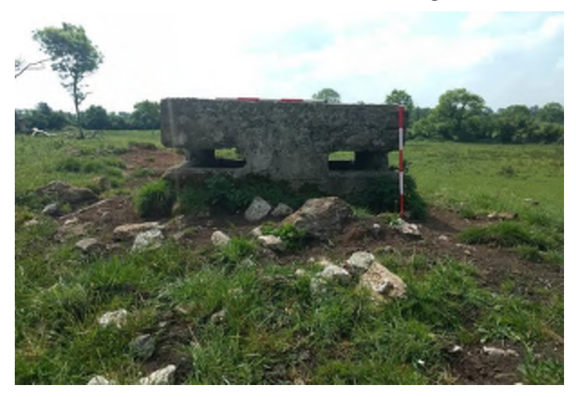
Plate 14.42 Northern elevation of BH 25, facing south