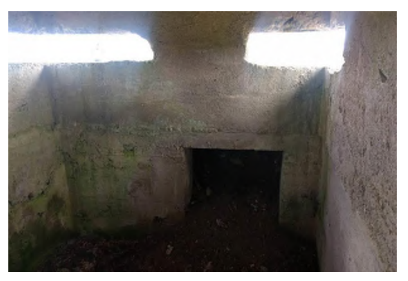
Plate 14.39 View of interior of BH 25, facing east