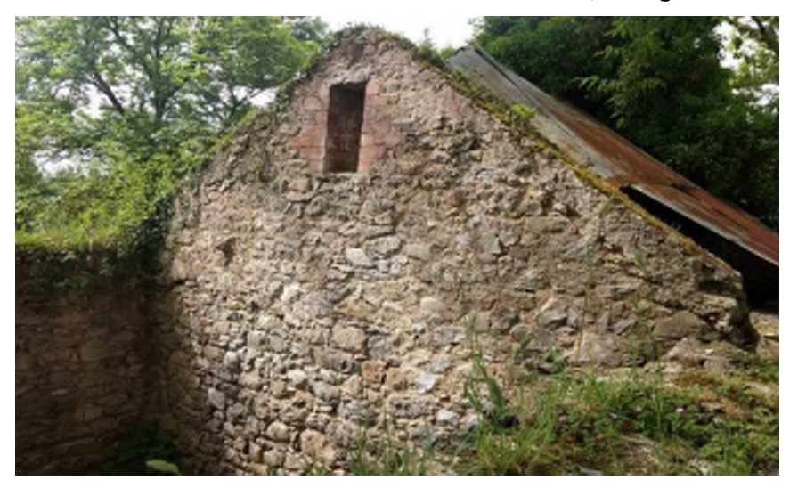
Plate 14.57 Western gable of vernacular farm structure Ch. 85, facing southeast