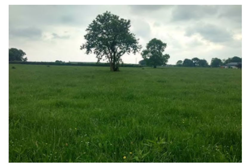
Plate 14.79 Field at Ch. 52+050, facing northeast