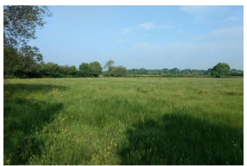
Plate 14.61 AAP 15, facing east-northeast