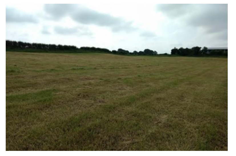
Plate 14.98 View towards possible moated site LI 57 facing southeast