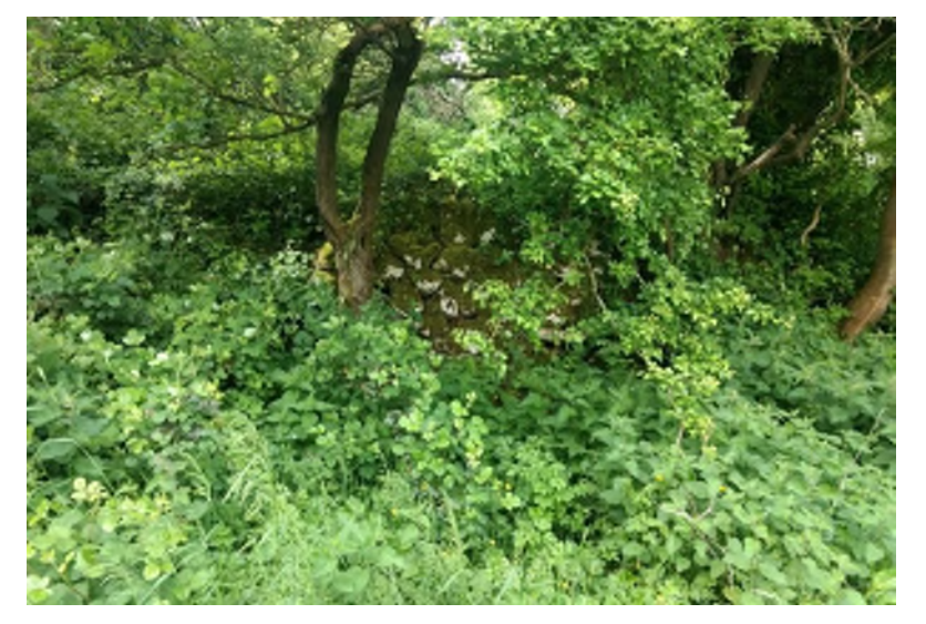
Plate 14.54 Ringfort AH 19, facing south-southwest