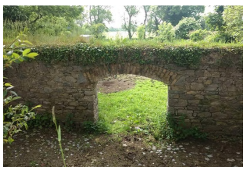
Plate 14.56 Vernaci

Vernacular farm structure Ch. 85, facing south