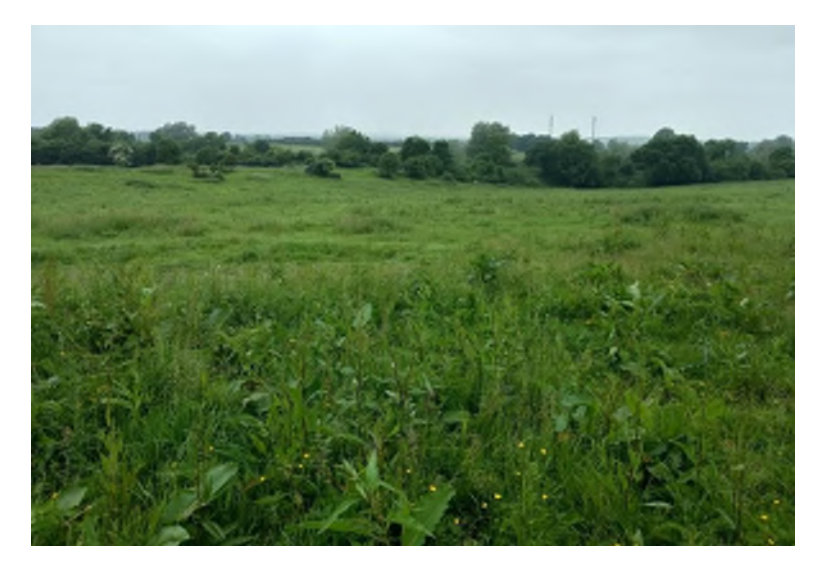
Plate 14.108 View towards AH 64, enclosure, facing northwest