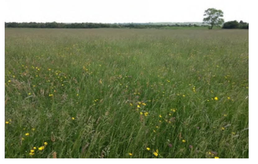
Plate 14.14 Field at Ch. 3+200, facing east