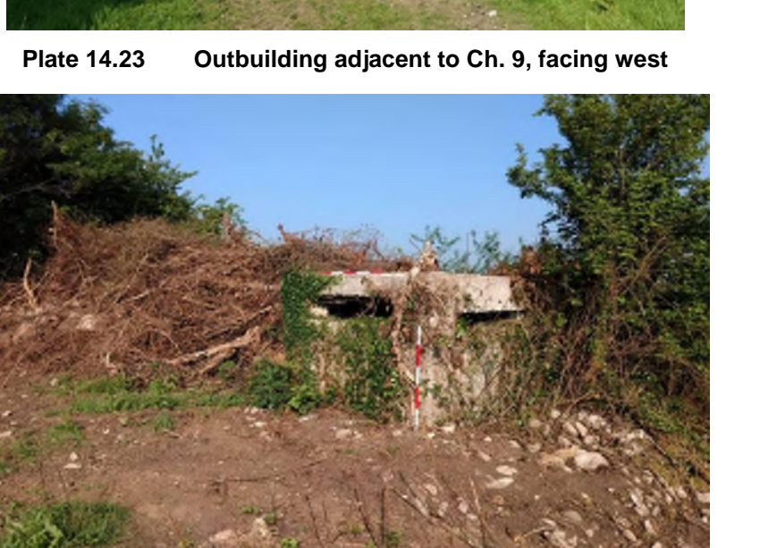
Plate 14.25 Pillbox Ch. 103, facing southwest showing north and east elevations