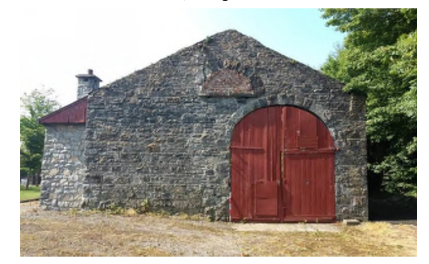
Plate 14.75 Goods shed BH 1 to the west of Irish Palatine Heritage Centre, facing southwest