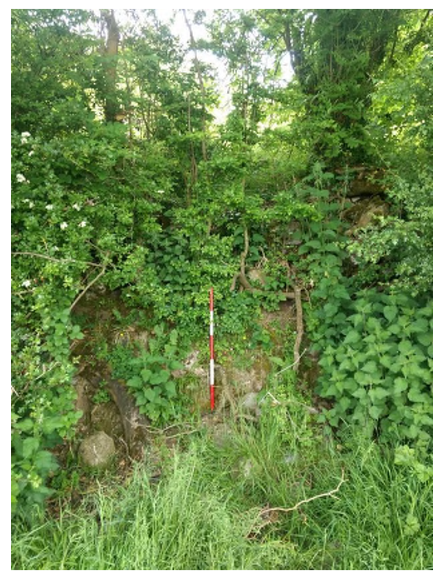
Plate 14.53 Ringfort AH 19, facing east