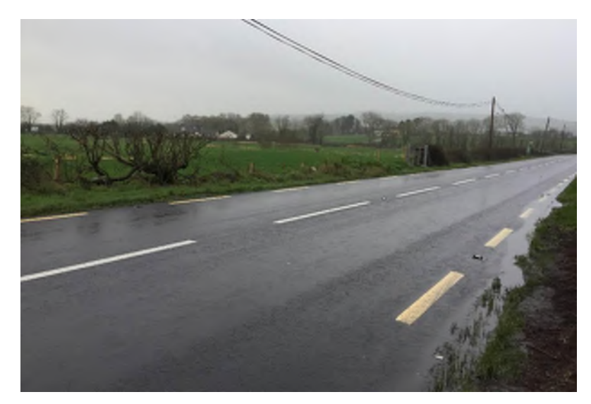
Plate 14.16 View from BH 17 Robertstown Church, facing west