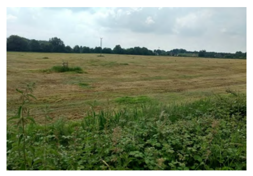
Plate 14.84 Field at Ch. 56+400, facing southwest