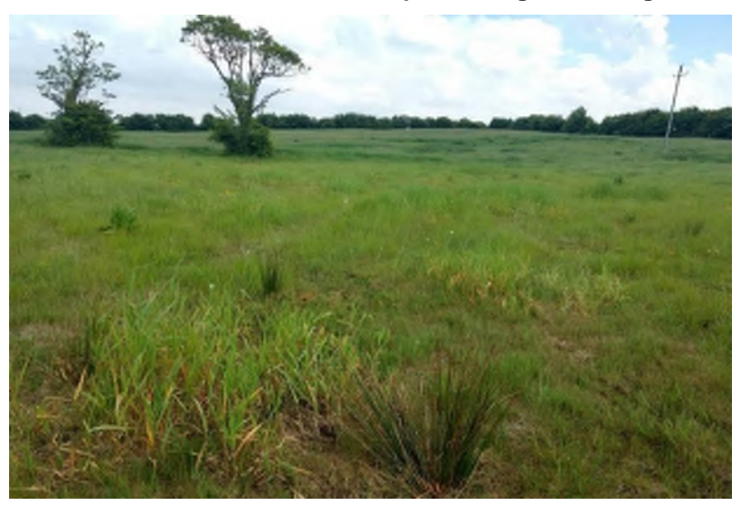
Plate 14.13 Relict field system Ch. 5, facing east