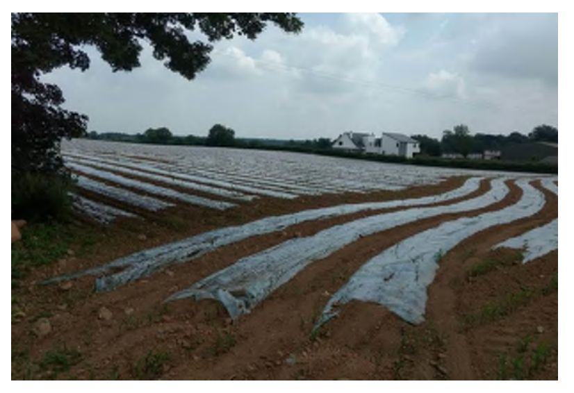
Plate 14.89 Field at Ch. 57+800, facing southeast