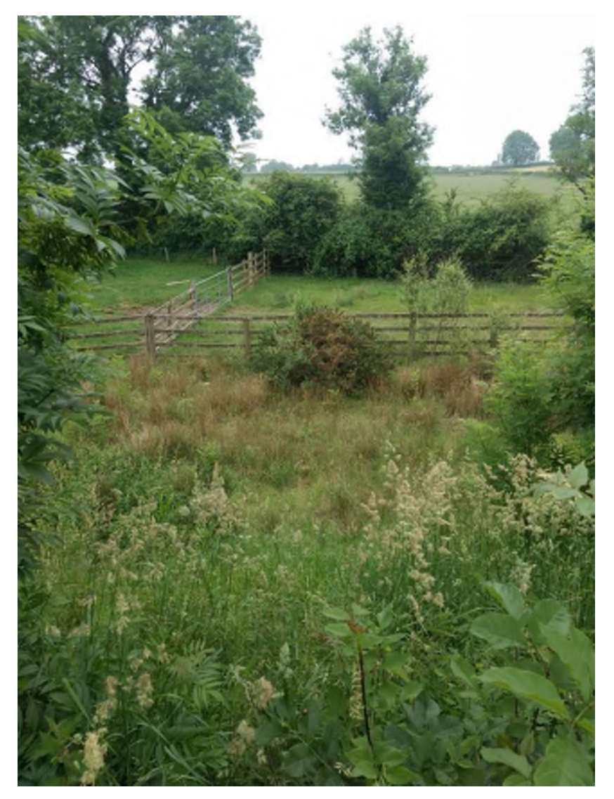
Plate 14.120 View from edge of existing N21, facing south