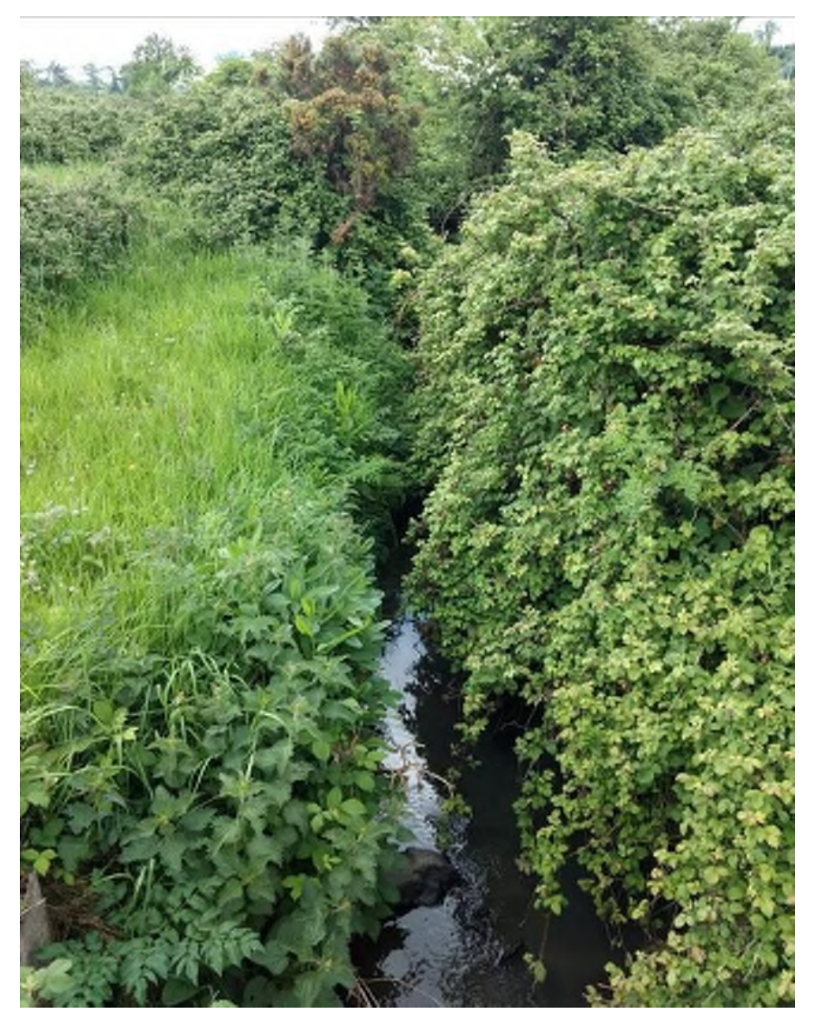
Plate 14.9 TB 2, facing southwest