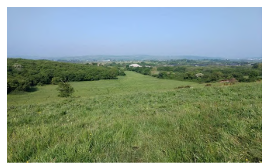
Plate 14.20 View from Ch. 4+950 towards Foynes and western end of the Scheme, facing west