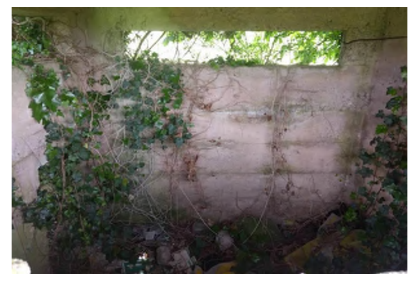
Plate 14.46 View of interior of pillbox Ch. 104, view from southwest