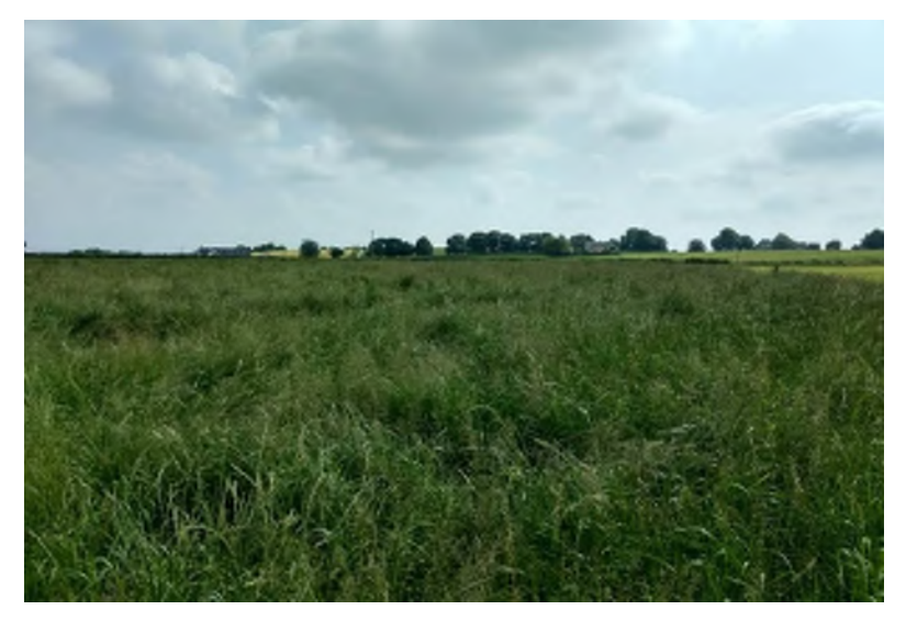
Plate 14.97 View from possible moated site LI 57 facing east