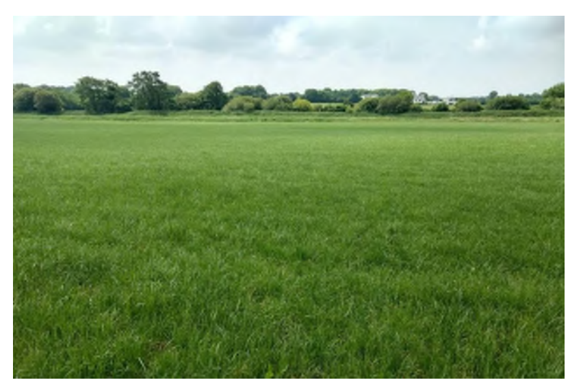
Plate 14.92 Field at Ch. 58+250 facing southwest