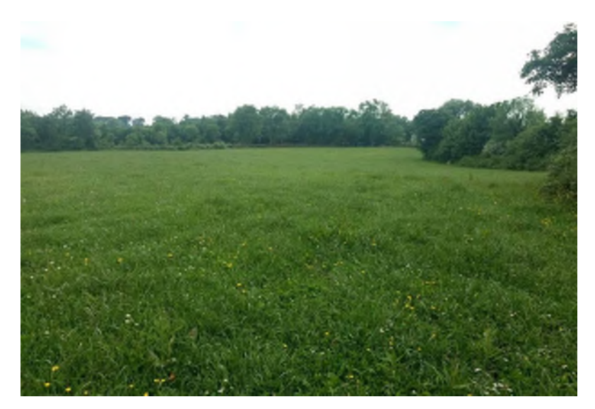
Plate 14.76 Field at Ch. 51+450, facing southwest