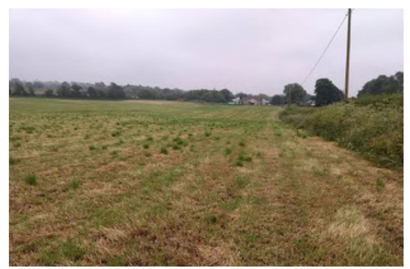
Plate 14.102 View towards LI 58, settlement plots, facing southeast