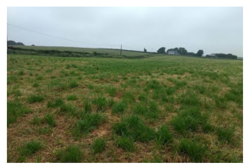
Plate 14.103 View towards LI 58, settlement plots, facing northwest