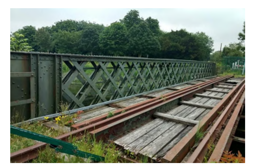
Plate 14.107 BH 23, railway bridge, facing southeast