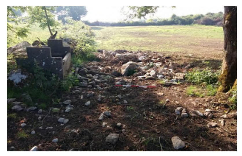
Plate 14.24 View towards Ch. 10, site of vernacular buildings, facing north