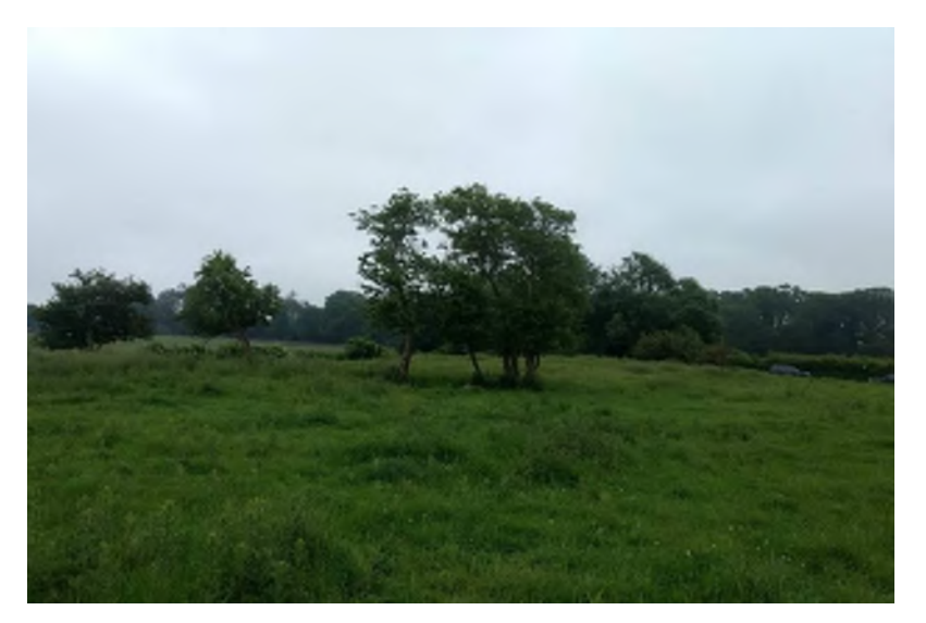
Plate 14.112 View of AH 42, enclosure, facing south