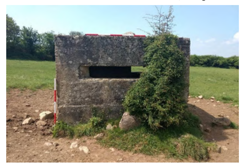
Plate 14.33 Western elevation of BH 26, facing east