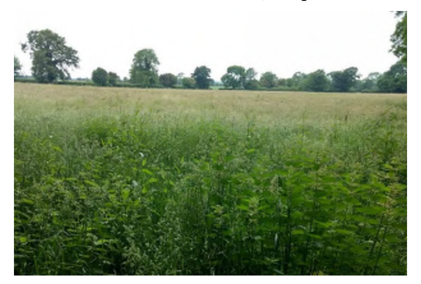
Plate 14.82 View towards LI 76, oval enclosure, facing north