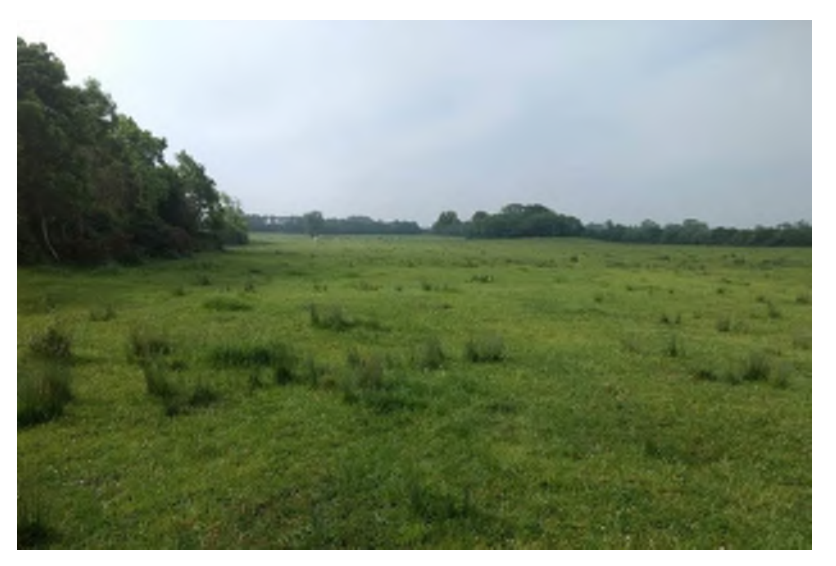
Plate 14.48 Field at Ch. 20+150, facing south, tree line from Ballyclogh demesne to the east