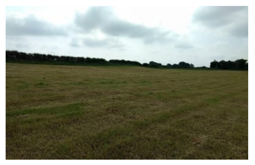
Plate 14.100 View towards possible moated site LI 57 facing southeast