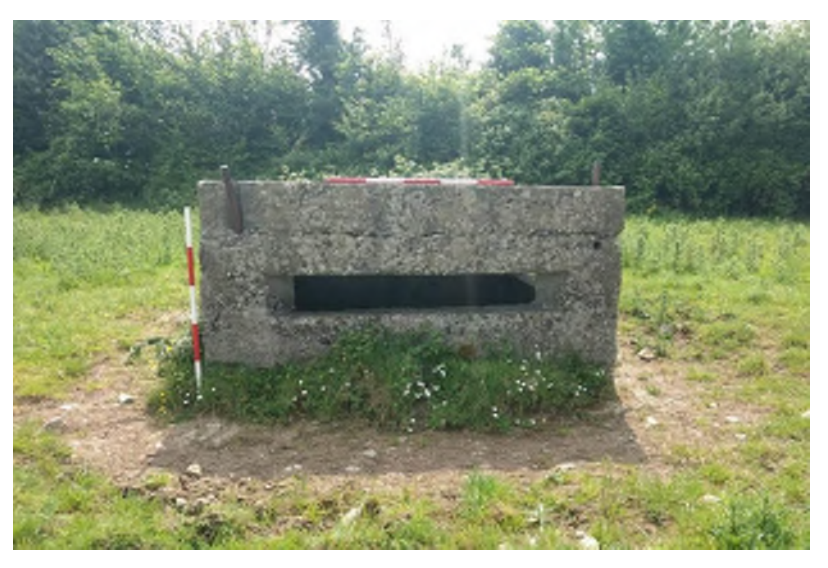
Plate 14.36 Northern elevation of BH 27, facing south