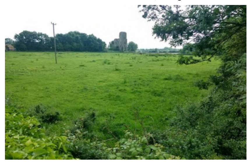
Plate 14.86 View towards AH 69, Clonshire Castle, facing southeast