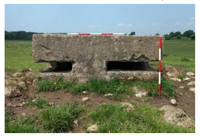
Plate 14.41 Eastern elevation of BH 25, facing west