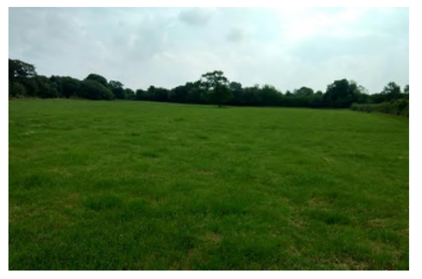
Plate 14.90 Field at Ch. 57+650, facing east-southeast