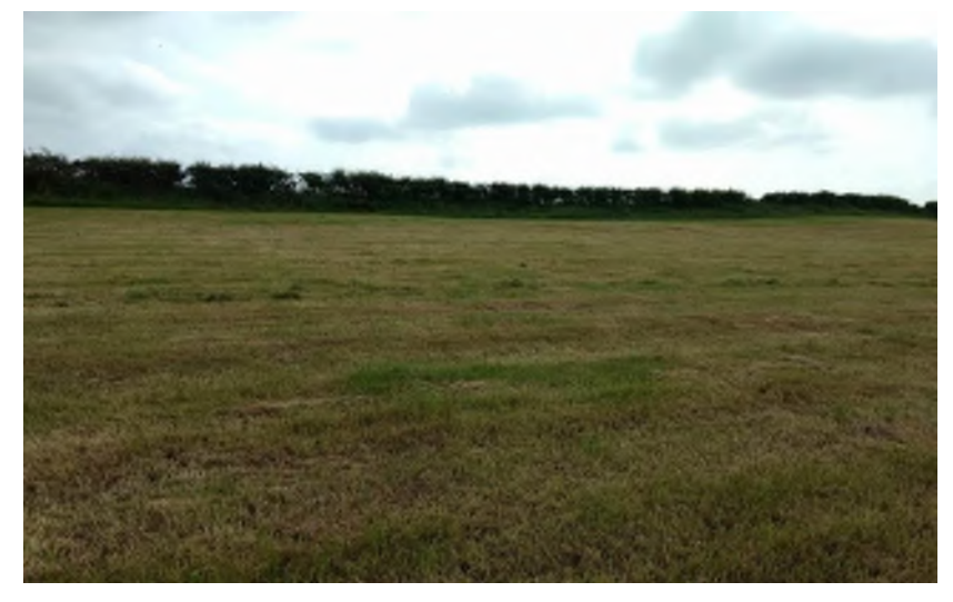
Plate 14.99 View towards possible moated site LI 57 facing eastsoutheast