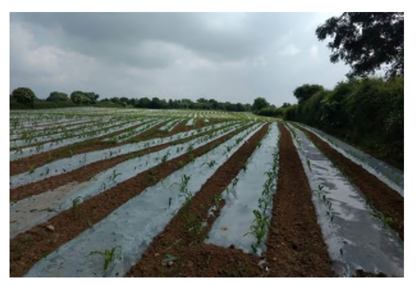
Plate 14.93 Field at Ch. 58+650 facing east