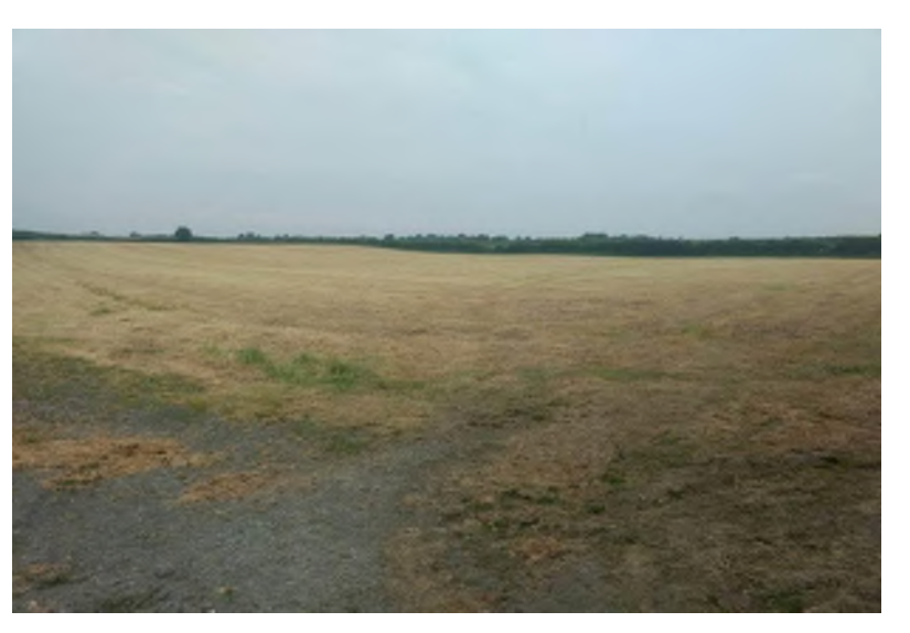
Plate 14.81 Field at Ch. 53+000, facing northwest