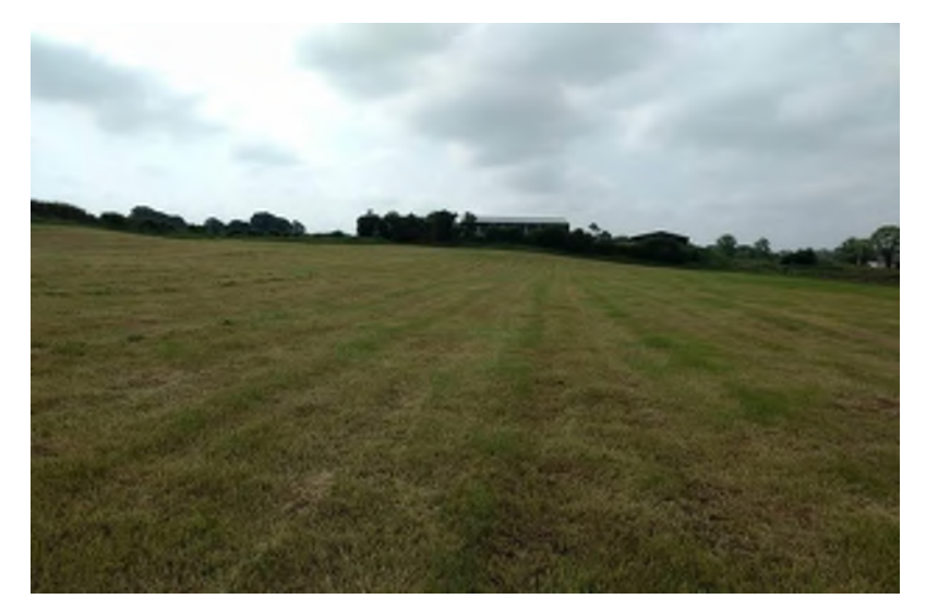
Plate 14.101 View towards possible moated site LI 57 facing south