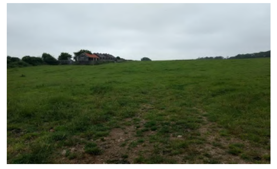
Plate 14.110 Vernacular farm structure Ch. 100 to the north, facing east