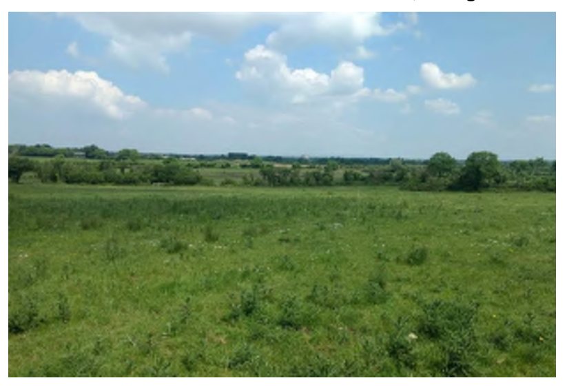
Plate 14.34 View from BH 27, facing northeast