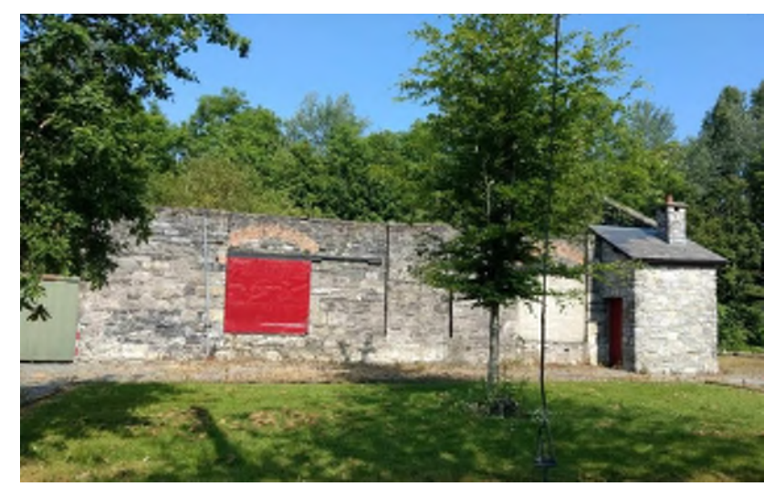
Plate 14.73 Goods shed BH 1 to the west of Irish Palatine Heritage Centre, facing northwest