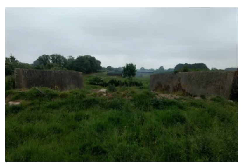
Plate 14.113 Farm structure in field at Ch. 62+200 facing east