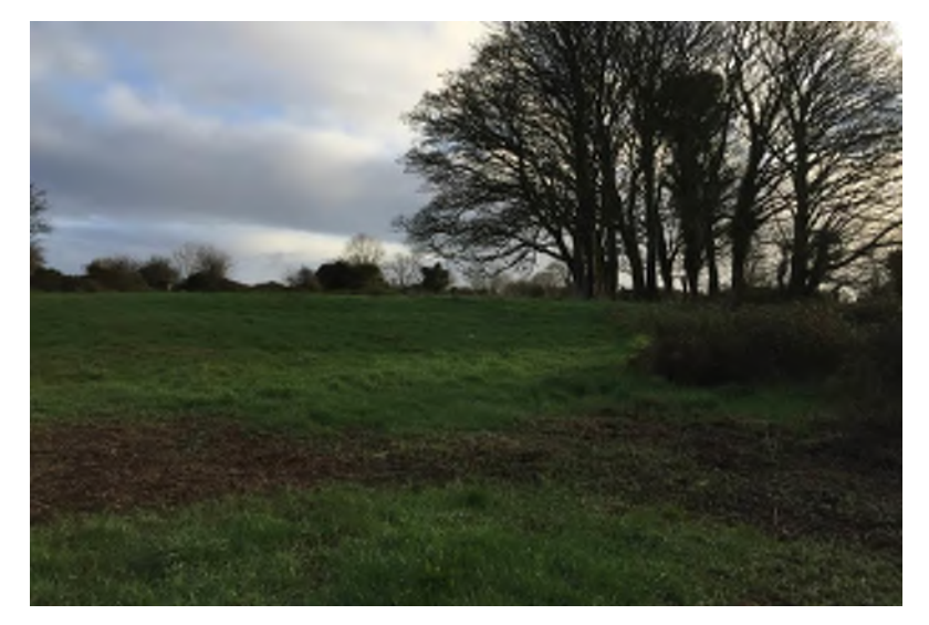
Plate 14.1 LI 4 oval raised area, facing southeast