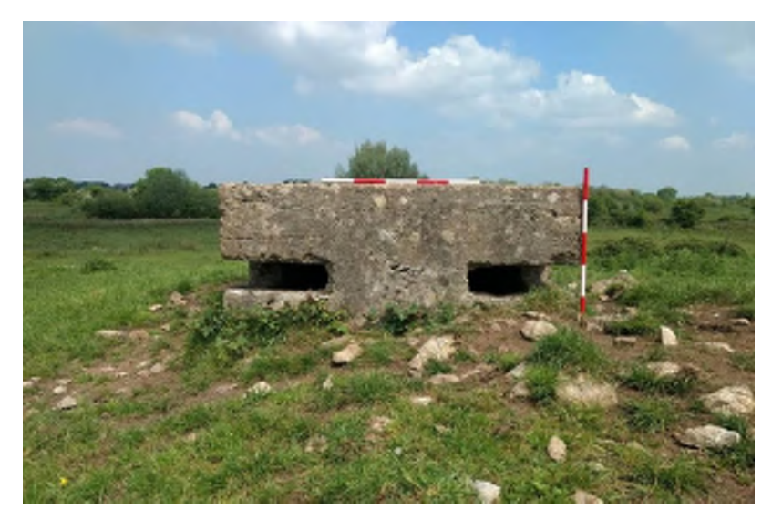
Plate 14.44 Southern elevation of BH 25, facing north