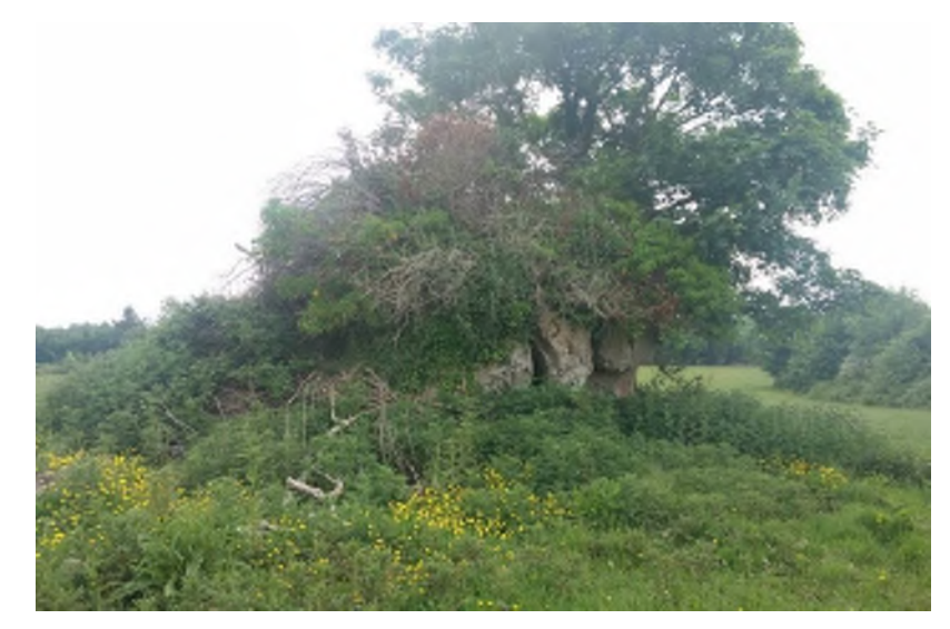
Plate 14.77 Stone outcrop in field at Ch. 51+450, facing southwest