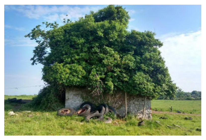
Plate 14.65 Disused limekiln Ch. 31, facing north